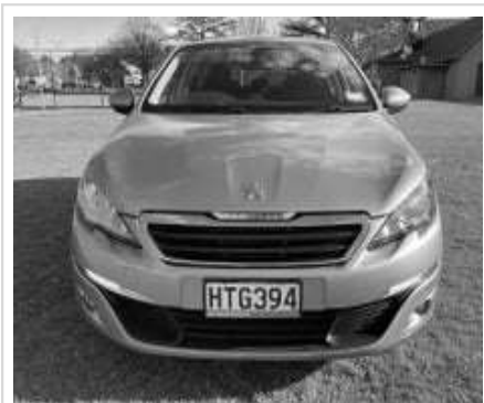
Photo of similar vehicle

Valid as at 31 August 2023 02:37 AM. Reference: 79982fbd